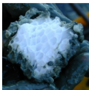
A block of a gas hydrate (methane clathrate) recovered from seafloor sediments off the Oregon coast.

Surface coatings developed by MIT researchers could inhibit buildup of methane hydrates that can block deep-sea oil and gas wells.